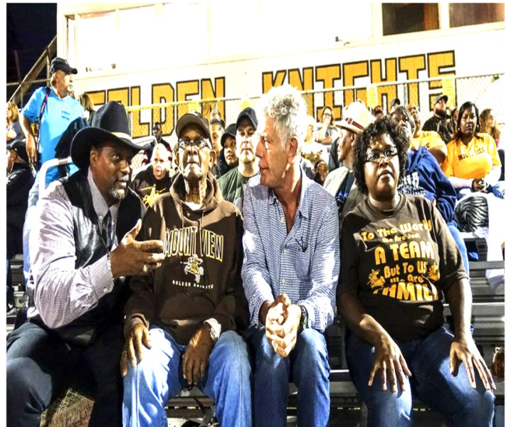
Bourdain watching the homecoming game at Mount View High School in McDowell County, where he noted, "there's an easy familiarity between people."

The economics are that of a forgotten land — but God has not forgotten, and many of us see him clearer there than in our day to day lives.